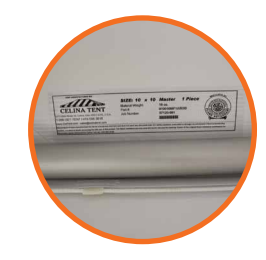
IDENTIFICATION LABEL FLAME CERTIFICATE