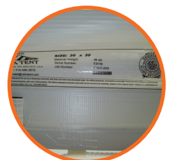
IDENTIFICATION LABEL / FLAME CERTIFICATE