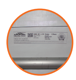
IDENTIFICATION LABEL FLAME CERTIFICATE