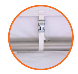
ALLIGATOR CLIPS & SIDEWALL ROPE