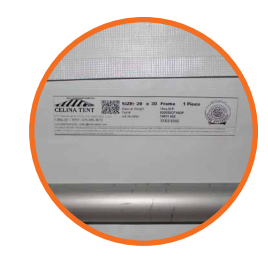
IDENTIFICATION LABEL FLAME CERTIFICATE